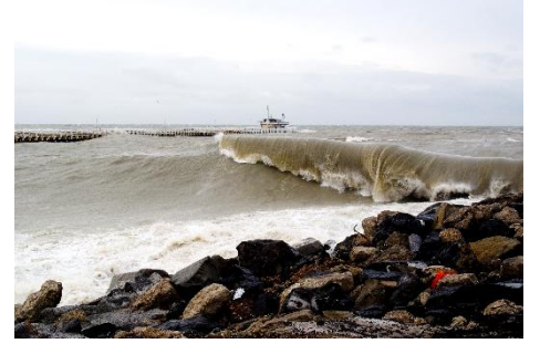
Storm surge at the Belgian coast