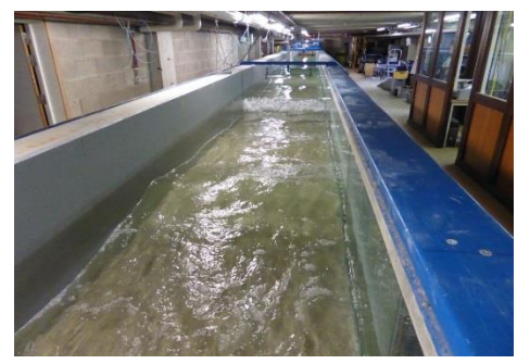
Wave flume facility at Ghent University